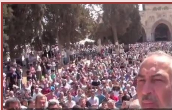
Palestine -The Blessed Land