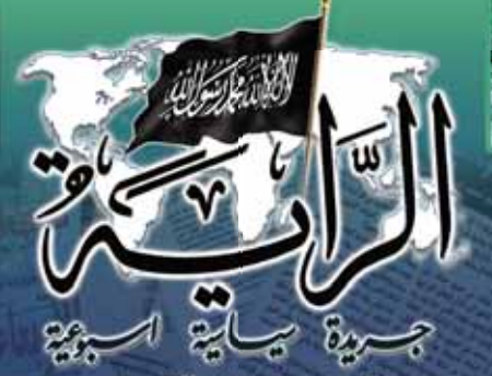
تصدرعن حزب التحرير