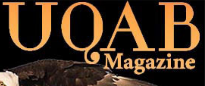
Issue 27 - Rajab 1440 AH / April 2019 CE