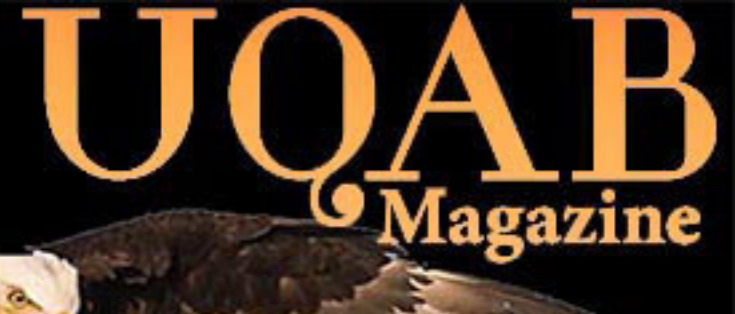
Issue 31 - Dhul-Qa'ada 1440 AH / August 2019 CE

The Secret of Love, Harmony and Respect in Married Life