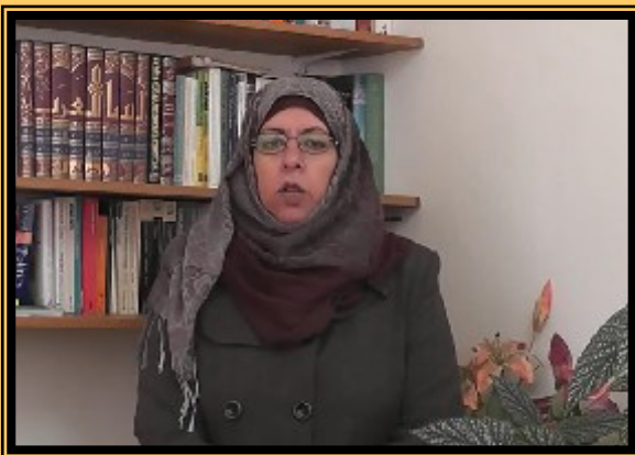
Om Suhaib ash-Shami Women Section of the Central Media Office